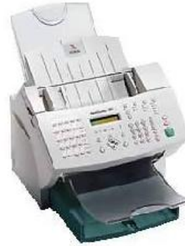
Xerox WorkCentre Pro 555 8PPM Laser Fax - Printer - Copier - Scanner w/ 14.4 kbps Modem